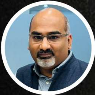
AVP- Sales & Marketing

Transforming construction management: Harnessing the rising power of AI